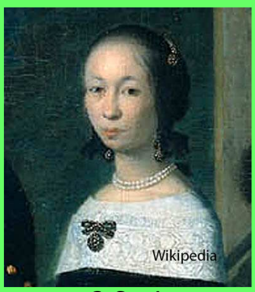
3. See 1

Detail, from a painting of Jacob Coeman 1665 <a href="https://en.wikipedia.org/wiki/Pieter Cnoll#/media/File:Jacob Coeman Portrait of Pieter Cnoll_and_his_familie_1665.jpg">https://en.wikipedia.org/wiki/Pieter Cnoll#/media/File:Jacob Coeman Portrait of Pieter Cnoll_and_his_familie_1665.jpg</a> (in the public domain)