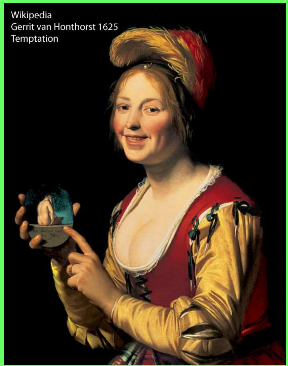
5. Temptation, smiling Dutch girl holding an obscene image, painting by Gerrit van Honthorst, circa 1630 https://commons.wikimedia.org/wiki/File:Smiling Girl, a Courtesan, Holding an Obscene Imag e.jpg (in the public domain)