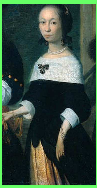
1, 2 Batavia young women, from a rich family; she is half Dutch, half Japanese, 17<sup>th</sup> century

Detail, from a painting of Jacob Coeman 1665 <a href="https://en.wikipedia.org/wiki/Pieter Cnoll#/media/File:Jacob Coeman Portrait of Pieter Cnoll_and_his_familie_1665.jpg">https://en.wikipedia.org/wiki/Pieter Cnoll#/media/File:Jacob Coeman Portrait of Pieter Cnoll_and_his_familie_1665.jpg</a> (in the public domain)